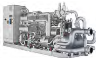
HeatPAC Variable-Speed Drive Screw compressor / R717 Hot water up to 90°C Heating capacity up to 1600 kW at 40°C source