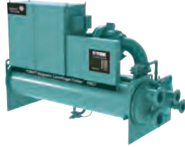
YMC² Water to water heat pump Variable speed centrif. compr. / R134a Magnetic bearings / R134a Hot water up to 65°C Heating cap.: 1600 to 3000 kW