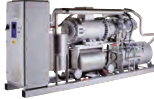
HeatPAC recip Variable-Speed Drive Reciprocating compr. / R717 Hot water up to 70°C Heating capacity up to 1200 kW at 40°C source