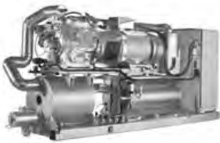
HeatPAC HPX recip Variable-Speed Drive Reciprocating compr. / R717 Hot water up to 90°C Heating capacity up to 600 kW at 40°C source