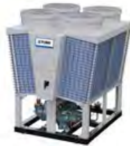
YHME Air to water HP Twin screw / R134a Hot water up to 55°C Heating capacity: 145 to 186 kW