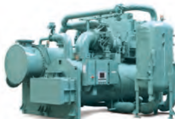
CYK HP Water to water heat pump Dual-Centrifugal compressors, Series-Arrangement / R134a Hot water up to 70°C Heating capacity from 2500 to 7000 kW