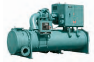
YK HP Water to water heat pump Centrifugal compr. / R134a Hot water up to 50°C (Std) Hot water up to 70°C (HP) Heating cap.: 1000 to 9000 kW