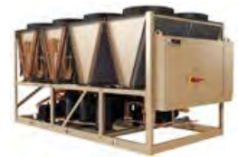
YLPB Air to water HP Scroll compr. / R410A Hot water up to 52°C Heating capacity: 352 to 669 kW