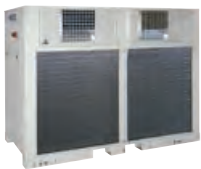
YLHD Air to water HP Scroll compr. / R410A Hot water up to 50°C Heating capacity: 23 to 160 kW