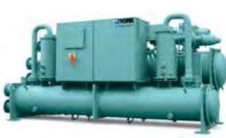
YVWA Water to water heat pump Screw compressor / R134a Hot water up to 65°C Heating cap.: 650 to 1250 kW