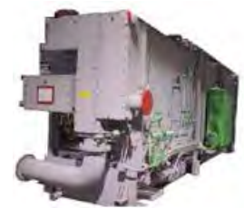
YHAP-C Single stage absorption Steam, Gas or Hot Water driven / R718 Hot water up to 95°C Heating cap.: 900 to 40000 kW