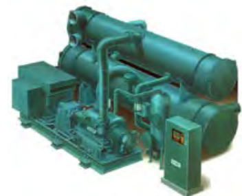
Titan OM HP Water to water heat pump Multi-stage Centrifugal, electric, steam or gas driven / R134a Hot water up to 90°C Heating capacity from 5000 to 20000 kW

Manufacturer reserves the rights to change specifications without prior notice.