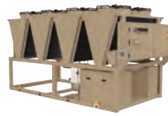
YLRA Air to water HP Scroll compr. / R410A Hot water up to 55°C Heating capacity: 200 to 327 kW