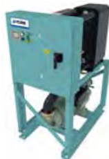
YCSE Water to water HP Screw compr. / R134a Hot water up to 55°C Heating capacity: 170 to 300 kW