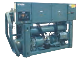
YLCS Water to water HP Twin screw / R134a Hot water up to 70°C Heating capacity: 400 to 2000 kW