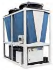
YMPA Air to water HP Scroll compr. / R410A Hot water up to 55°C Heating capacity: 48 to 255 kW