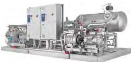
HeatPAC Custom Two-stage cascade VSD Screw compressor / R717 Hot water up to 90°C Reciprocating compressor / R717 Hot water up to 70°C Heating cap. up to +3000 kW at 40°C source