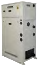
YMWA Water to water HP Scroll compr. / R410A Hot water up to 55°C Heating capacity: 25 to 210 kW