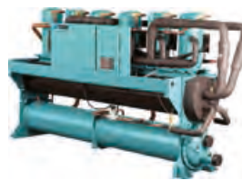
YCWL Water to water HP Scroll compr. / R410A Hot water up to 52°C Heating capacity: 210 to 675 kW