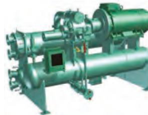
SHP Water to water heat pump Screw VSD compr. / R134a Hot water up to 80°C Heating cap.: 700 to 3000 kW